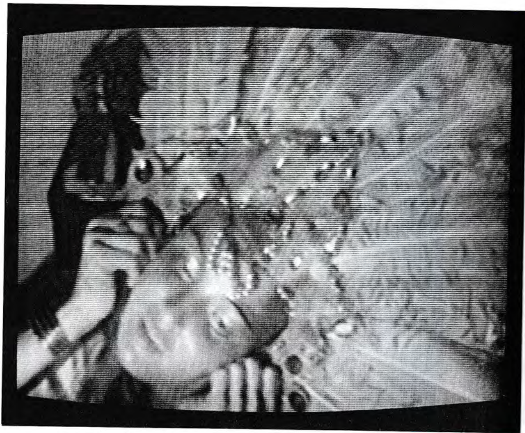
Joan Jonas, Organic Honey's Visual Telepathy , 1972.

cence can often be mistaken for her real face, until the uncanniness of the likeness reveals the obvious differences—the mask's lack of cheekbone delineations, skin texture, and so forth. In the realization of this difference we are set at as great a distance from the "real" Jonas as the closeness we thought we had—a distance that is emphasized by the glare of studio light as it bounces off the mask's slick plastic surface. But it is this function of distancing that takes Jonas's use of the mask—purchased at a store selling erotica—beyond mere rejection of any carnivalesque enchantment with organicism. This distancing ironizes the implications of her pseudonym—"Organic Honey"—chosen at the time the video was produced. For what she hides, as she hides behind this mask, is the problematic tendency of the viewing subject to reduce gender to "organic," "natural" meaning.