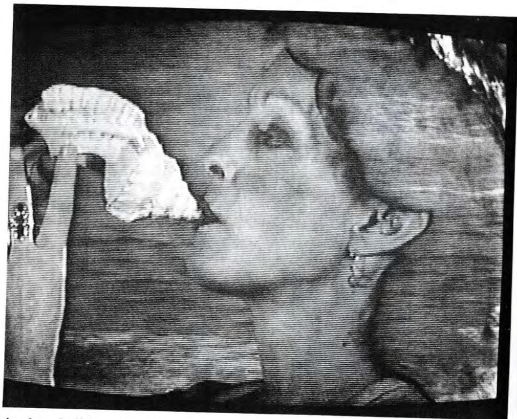
Joan Jonas, Double Lunar Dogs , 1984.

that site of otherness known as the body—not the ideologized natural body of which Bakhtin speaks, but the socialized and psychologized body, the body-in-fragment.