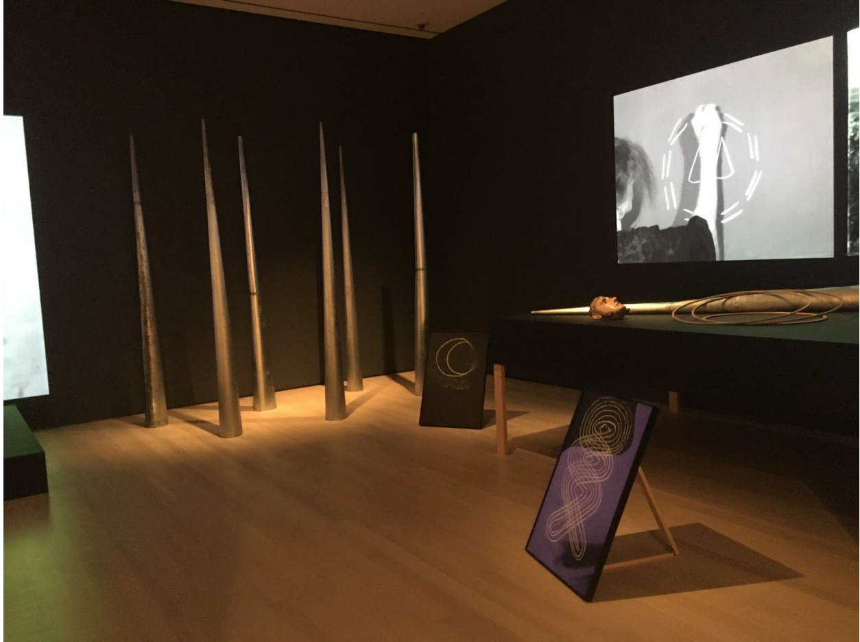
Northeast corner. At rear, six unique cones of slightly different heights. On the floor, two framed chalk drawings with easel backs.