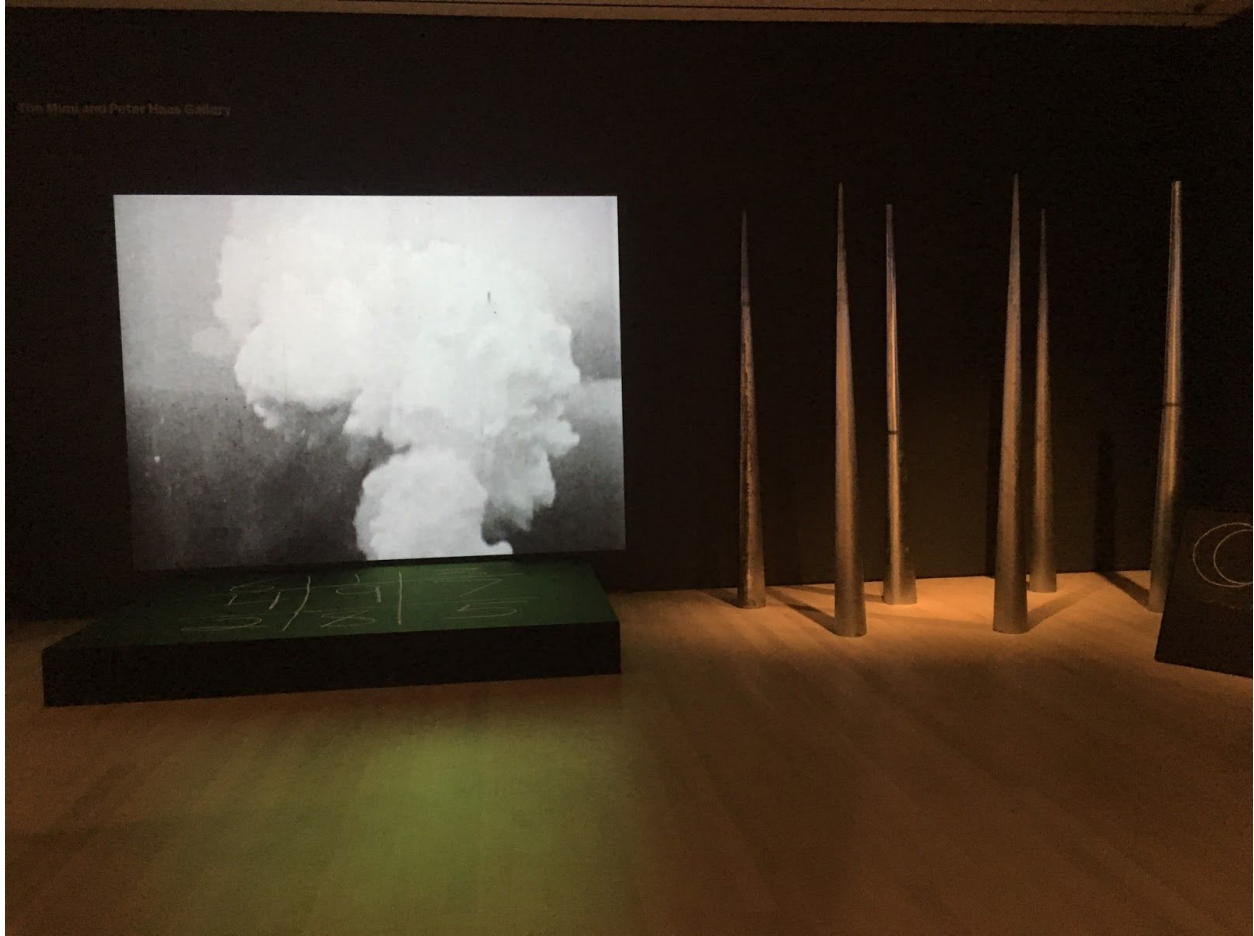
North wall. (37' W x 14.5' H) Chalk hopscotch drawing by the artist, on a stage made for the exhibition according to the artist's instructions.